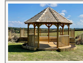
WEDDING ARBOUR DECORATED YOUR WAY FOR YOUR DAY!