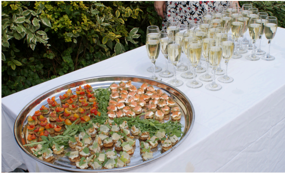
CANAPÉS & CHAMPAGNE