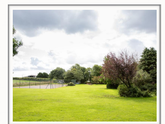
RELAX AND PLAY TENNIS & CROQUET